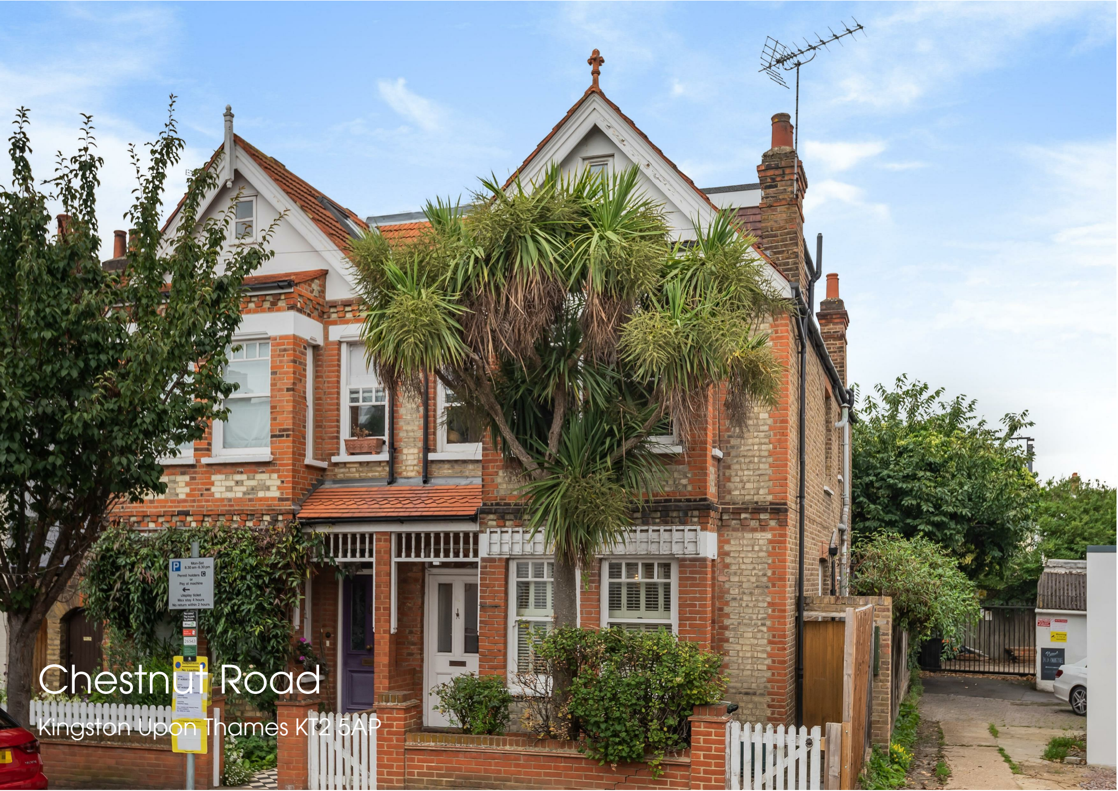
Chestnut Road Kingston upon Thames KT2 5AP

34 Richmond Road Kingston upon Thames Surrey KT2 5ED www.gibsonlane.co.uk Tel: 020 8546 5444